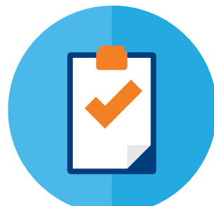
VSPHERE HARDENING, CHANGE, CONFIGURATION AND REGULATORY COMPLIANCE