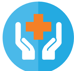
PERFORMANCE AND INFRASTRUCTURE HEALTH MANAGEMENT