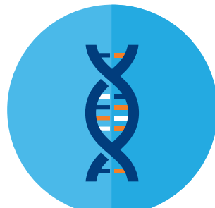
APPLICATION DEPENDENCY MAPPING