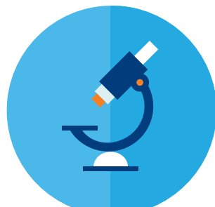
STORAGE AND NETWORK VISIBILITY