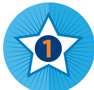
UNIFIED MANAGEMENT THROUGH AN OPEN AND EXTENSIBLE PLATFORM