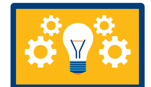
SELF-LEARNING MANAGEMENT TOOLS