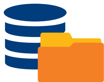
ALL MACHINE DATA

Wake up from the nightmare with VMware® vRealize™ Operations Insight, a unified management solution with predictive analytics, for performance management, capacity optimization, and real-time log analytics.