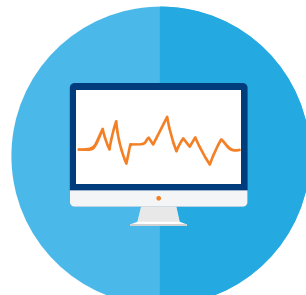
REAL-TIME LOG ANALYTICS